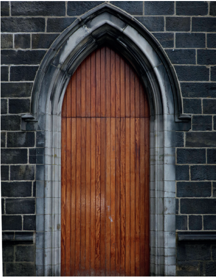
Holy Door before Opening, St. Muredach's Cathedral